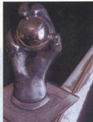
This trophy, one of Palmer's three Cy Young Awards, is one of many he keeps on display in his home.