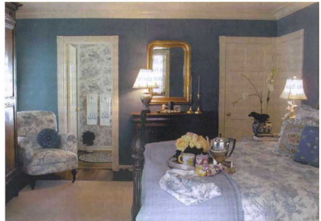
Opposite: The formal living room features a stately grand piano in the window alcove, a Georgian secretary and a 1950s-era sofa reupholstered in a subtle cream print. The twin coffee tables were custom-made from a pair of antique iron folding stools. Above: The master bedroom's tone-on-tone blue walls are a backdrop for a large country French armoire, Louis Philippe commode chest and heavy wrought-iron bed. The blue toile bed linens are echoed by the upholstered lounge chair and the toile wallpaper in the adjoining bath. Below left: The formal dining room's muted-green walls incorporate a mural of trees and native Florida birds. The sideboard and dining set are traditional; the chair seats have been upholstered in playful stripes. Below right: This antique English chaise lounge in the loggia sports a whimsical blue-and-yellow print.